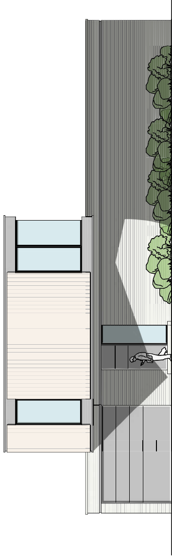
NORTH ELEVATION SCALE 1:100 @ A3